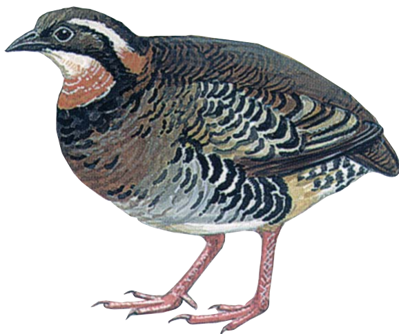
Orange-necked Partridge Arborophila davidi